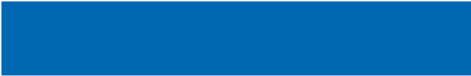
# of licenses group sites